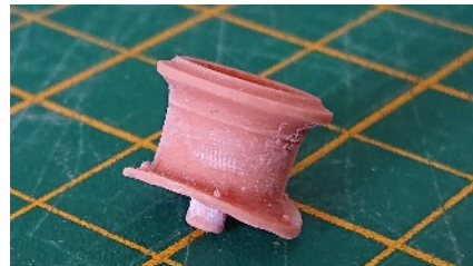
J39 Chimney, 7mm scale

Chimneys Corridor connectors Torpedo vents Roofs to any profile Carriage sides and ends